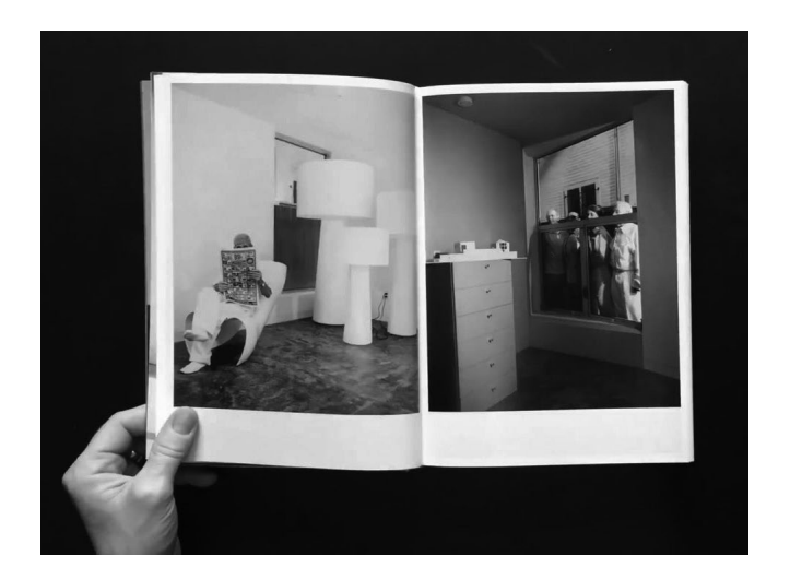
Figure 3: Image of the book A house is a house is a house : Architectures and Collaborations of Johnston Marklee. Springer Vienna Architecture, featuring photographs by Livia Corona of the Sale house. Quotation right.

the mirror of the same size that covers the opposite wall. The mirror multiplies the effect while simultaneously breaking the linearity of the hallways.